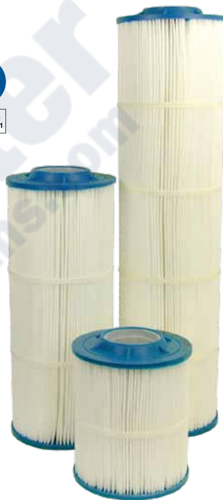
Premium Hurricane® Harmsco-Free Cartridges