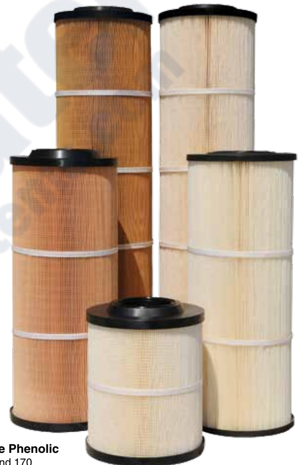
Cellulose Phenolic 90 and 170