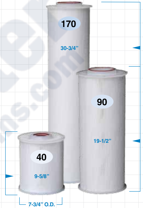
Hurricane® All-Poly Cartridges Length and O.D.