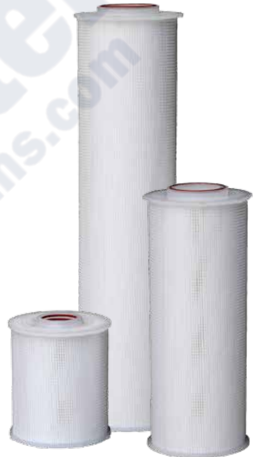
Premium Hurricane® All-Poly Cartridges