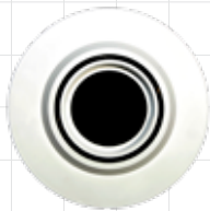
1 Micron Fine 1-5

End Caps: color coded for easy nominal micron identification