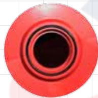
20 Micron Medium 10-20