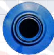
50 Micron Coarse 30-50