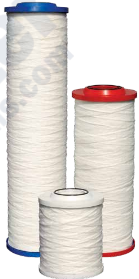
Harmsco® Premium String Wound Cartridges