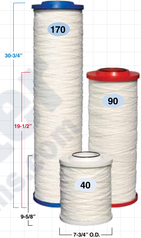
Harmsco® Premium String Wound Cartridges Length and O.D.

End Caps: color coded for easy nominal micron identification