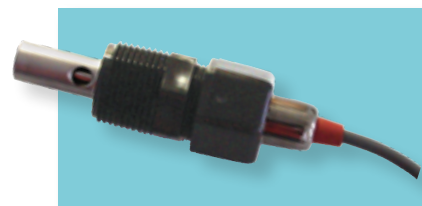
Assembled Resistivity Sensor

The CS10 was designed primarily for use in pure water applications.