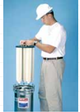
Cartridge Cluster Filters

All cartridges in our 7, 14, 16, 21 and 24 models are arranged in a single "cartridge cluster," so all cartridges are removed at one time for easy cartridge cleaning or replacement.